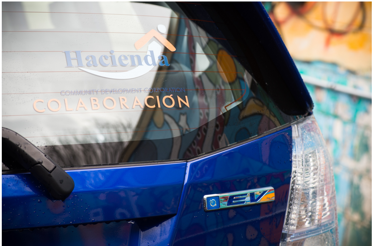
Image 2: Colaboración's Hacienda CDC decal. There was also a smaller Forth decal on the left side of the back window of each car.

Each Honda Fit EV had a Forth logo and Hacienda CDC logo located on the rearview window. The cars were also named to easily distinguish them from each other since they otherwise looked exactly the same. To help build excitement for the project, Hacienda CDC staff were asked to submit potential names for the cars. The winning names for the three cars were Spanish translations of three of Hacienda CDC's six organizational values, Integridad (integrity), Colaboración (collaboration), and Respeto (respect). Forth and Hacienda CDC felt these three values also best fit the ideals of the project.