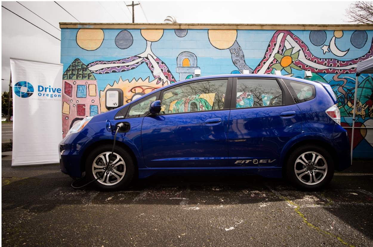
Image 1: One of the Fit EVs parked in front of the EVSE. The wall with the mural is the western-most wall of the communal laundry facility

Forth worked extensively with three of Hacienda CDC's staff members to implement and execute the project. These three employees were responsible for managing reservations of the vehicles, maintaining the cars, and any onsite issues. Forth was responsible for securing funding, project design and evaluation, acquisition of the cars and charging, and troubleshooting any problems that arose and could be resolved remotely. Both organizations collaborated on outreach and education for the project. In March 2017, three Blink Charging Level 2 EVSE were installed by an electrician near Hacienda CDC's main office and centrally located by Hacienda CDC's nine multi-family housing units. At the project site, the Honda Fit EVs were parked near the EVSE and available to both employees and residents. This site was selected for the EVSE and cars because it was a previously empty, but paved lot, and would not take away any existing parking used by residents or staff. Additionally, the lot selected is located right next to a common laundry facility which had more than enough excess electrical capacity for the three EVSE.