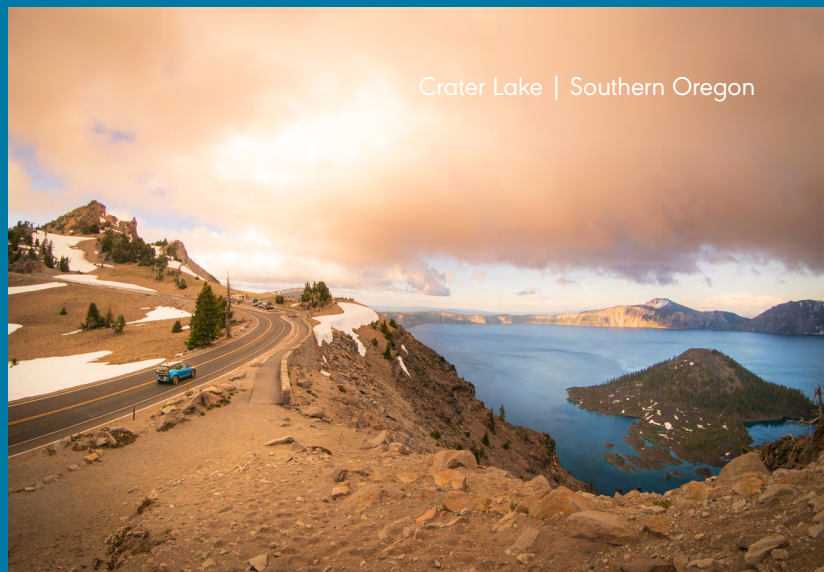
Crater Lake | Southern Oregon