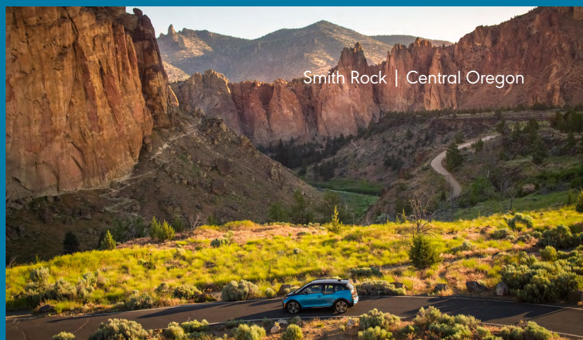
Smith Rock | Central Oregon