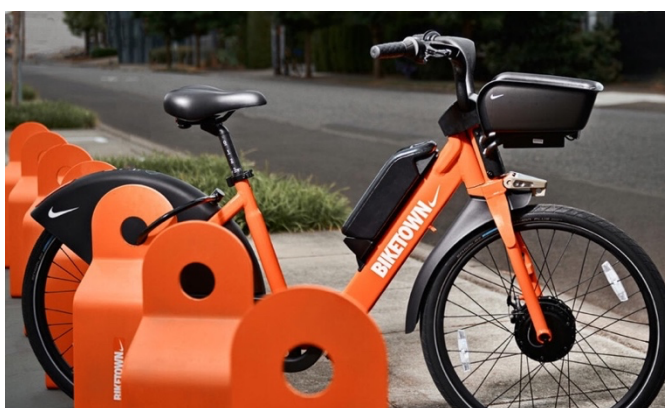
Corporate sponsorships like Nike's bikeshare program in Portland, Oregon, could be one model that carshares adopt to bring in revenue.

Forth also is exploring a "mixed use" concept for carshare vehicles, split between business and public purposes. In an example of this scenario, a housing site's staff could use the carshare vehicle at the market rate, which would be less than owning a fleet vehicle or paying a mileage per diem. The housing site's fees for use would then provide funding to support a lower rate for building residents or the general public.