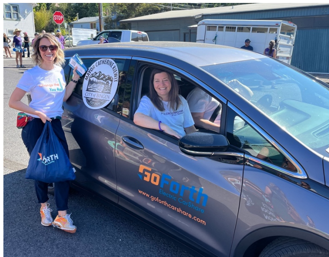
Member services staff ensure a smooth experience for users by offering education and support for carsharing programs.