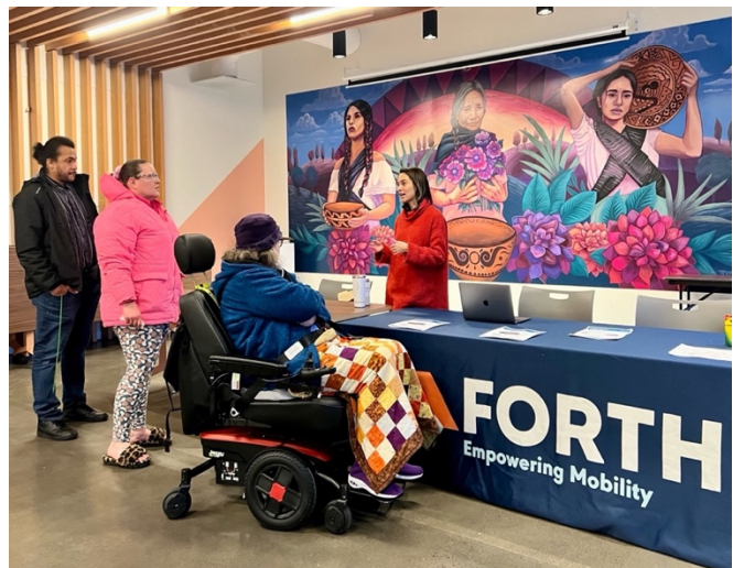
In-person community events are an effective way to educate potential members about the benefits of EV carsharing programs.